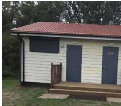
The club house was eventually built several years later.